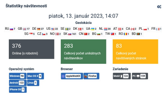
Website traffic statistics with CMS Joomla 4