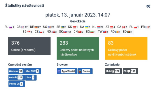
Website traffic statistics with CMS Joomla 4